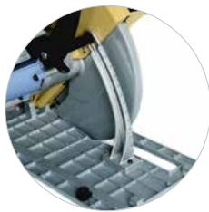
Depth adjustment with scaling