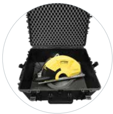
Optional: Transport case with wheels Ref. 60827Box